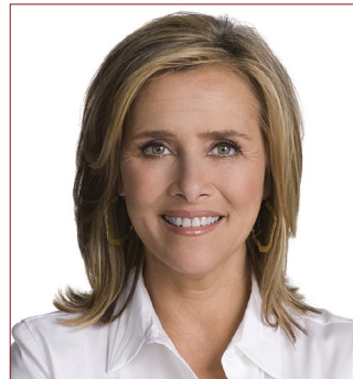
Meredith Vieira Emmy®-winning American Journalist and Talk Show Host