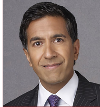
Sanjay Gupta, MD Emmy®-winning Chief Medical Correspondent, CNN Health and Medical; Associate Chief of Neurosurgery, Grady Memorial Hospital; Faculty Neurosurgeon, Emory Clinic